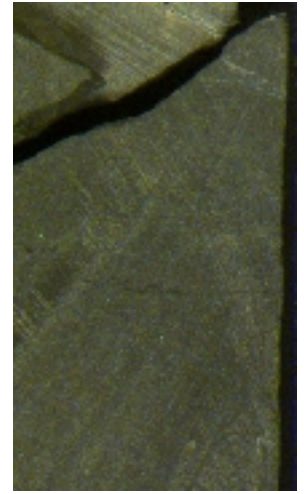
801C 2R3 67-71