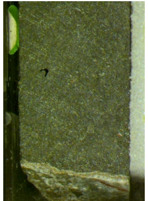
801C 2R5 47-52