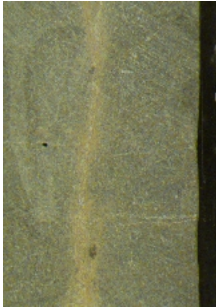
801C 1R6 81-85

probably turned around during splg or in photograph