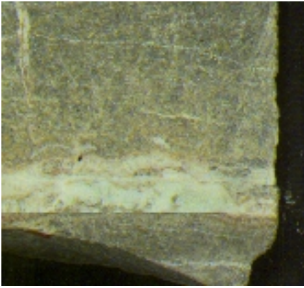
801C 1R5 80-82

probably turned around during splg or in photograph