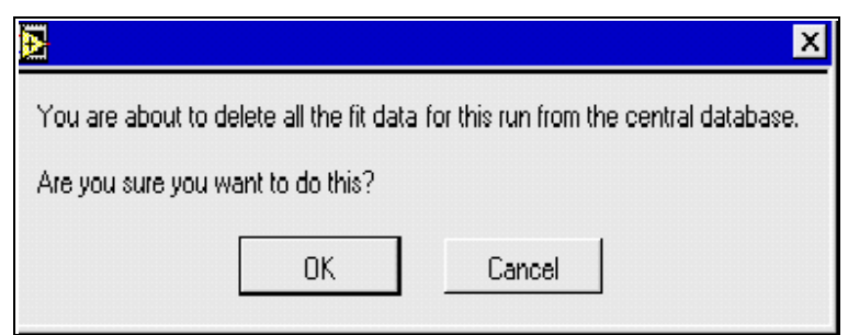
Figure 17. Warning for deleting fit data

The following message is displayed before the function will continue. Click OK to proceed, or Cancel to stop the deletion.